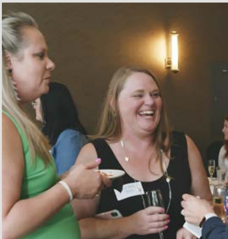
"A borderless membership-based program delivering educational content, career development targeted in the ag-energy sustainability sectors, and exclusive networking benefits for the women on your team leading in this emerging space."

Allow us to support your mission of advancing women's leadership roles in this space by making this YOUR initiative and sponsoring and sending employees to the group. Allow us to do the work to create the content, the network, the speakers, the value, and opportunity. All you need to do is provide a little bit of time and encouragement to team members and allow them to join.